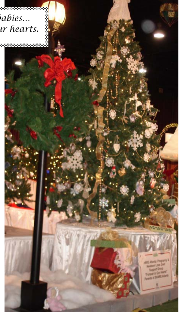
SHARE Atlanta's 2006 Festival of Trees' Memorial Tree "Forever in our Hearts"